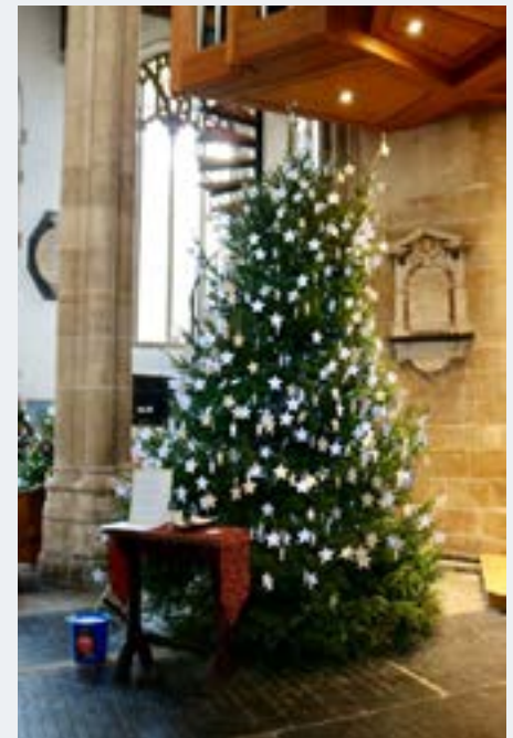
Pictured: Gordon Barber's sponsored tree stands tall as part of the 2019 Christmas Tree Festival in Norwich.

Gordon Barber Funeral Directors were among the local businesses sponsoring a glittering display at the annual Christmas Tree